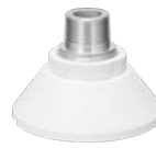
WV-QSR506M-W Mount Bracket