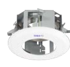
WV-QEM505-W Ceiling Mount Bracket