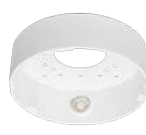
WV-QJB505-W Base Bracket