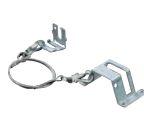
WV-Q105A Mount Bracket