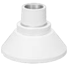
WV-QSR506F1-W Mount Bracket