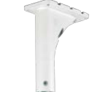
WV-QCL501-W Mount Bracket