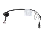
WV-QCA501A I/O Cable