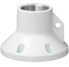
WV-QCL101-W Mount Bracket