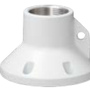
WV-QCL100-W Mount Bracket