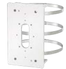
WV-QPL500-W Mount Bracket