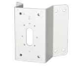
WV-QCN500-W Mount Bracket